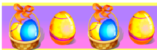
Soon it will be Easter - Yippe!!