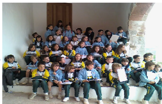
Some of the students at the Magdalena.